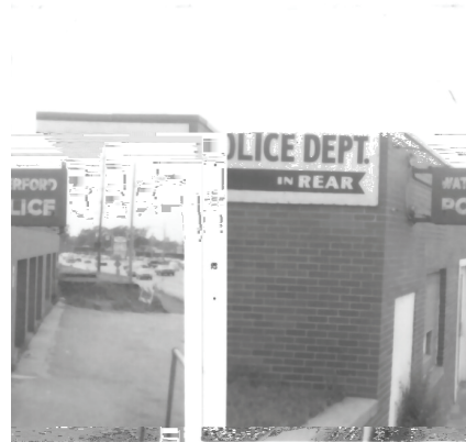
Police Department with M-59 on right. We are still trying to date this picture.

A Demolition Permit for the old Town Hall building was applied for in late August of 2002. The site work for the new CVS Pharmacy began in early November of 2002, at which point the Town Hall building was already torn down. Goodbye to an old and well-used friend!